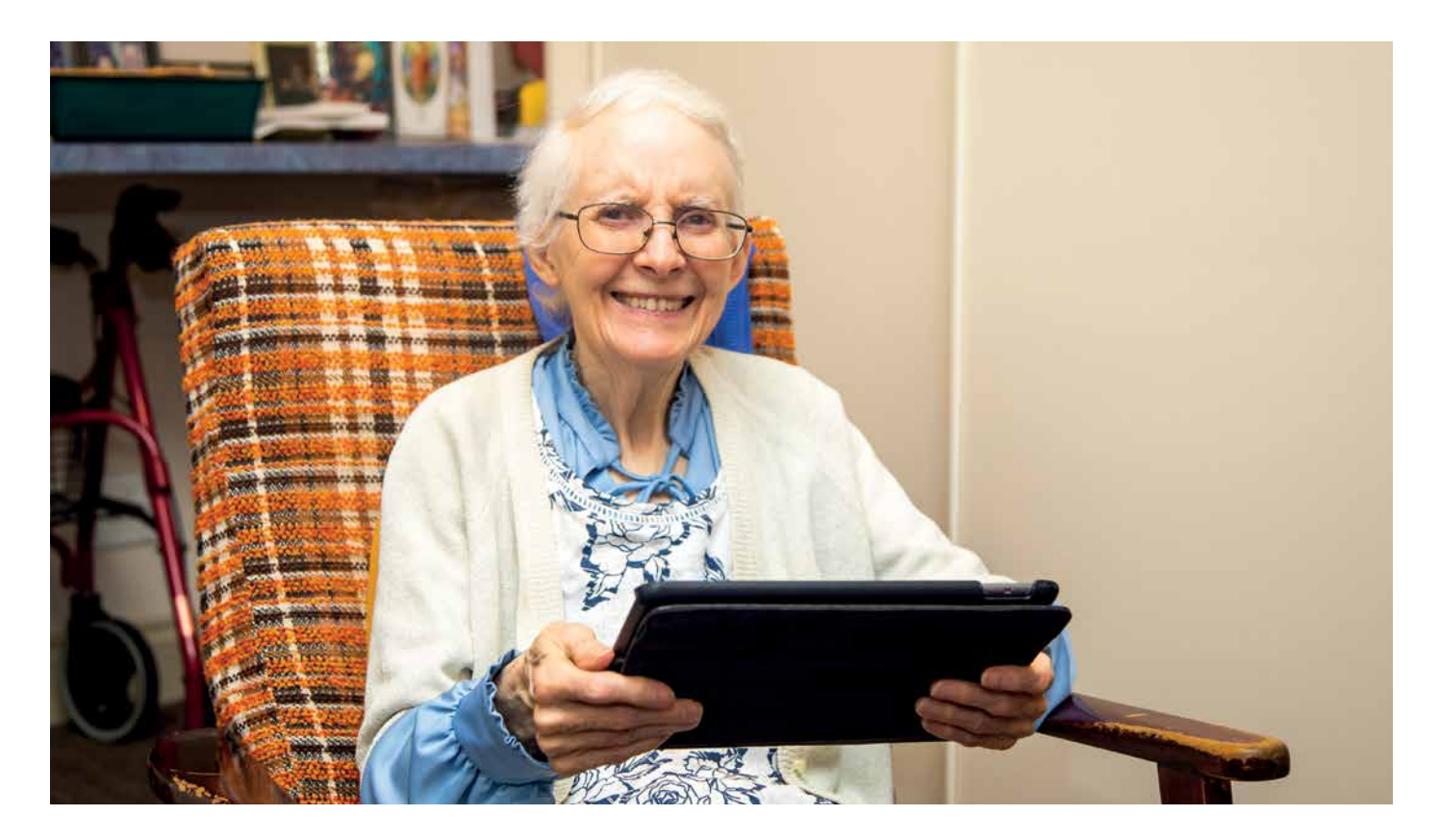
Our Culture, Our Value: The Costs of Hearing Loss in Australia

Within the present study as with our most recent studies exploring Auslan and early intervention we employ a DALY approach to determining the impact of deafness and hearing loss. We employ the estimates contained within those reports and derive estimates from distributions of hearing loss by age to determine the total costs of deafness and hearing loss.