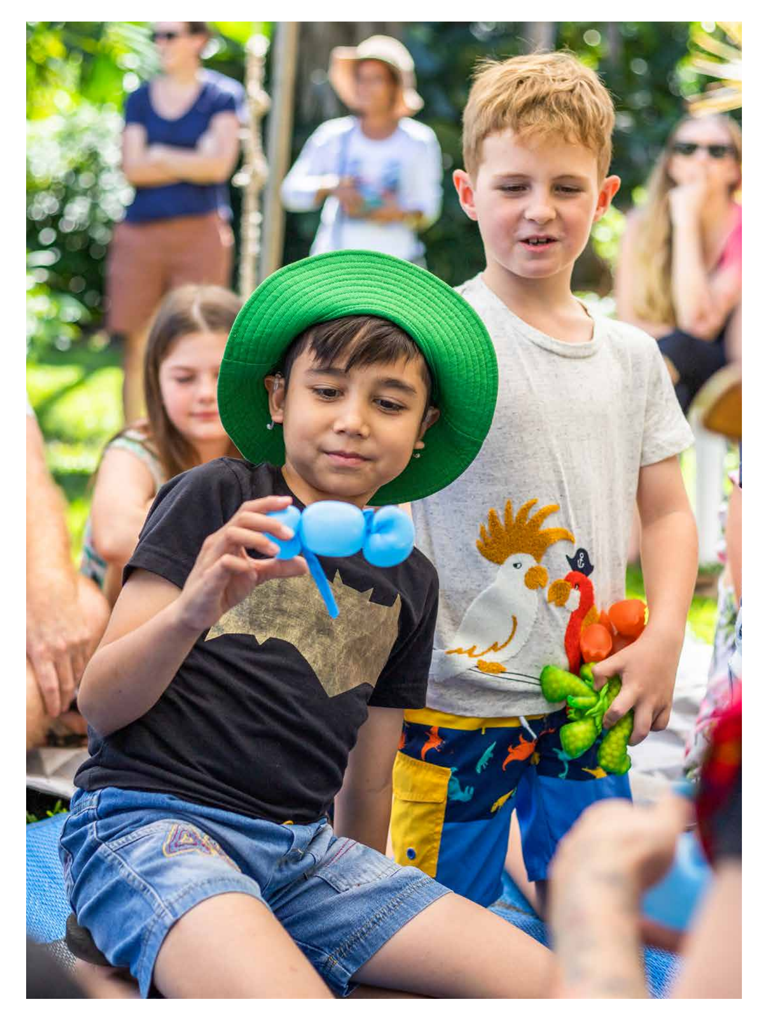
Our Culture, Our Value: The Costs of Hearing Loss in Australia